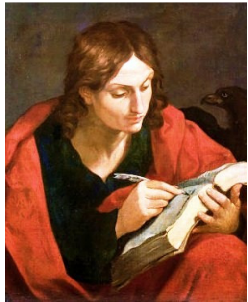
All Saints Sunday November 6 th