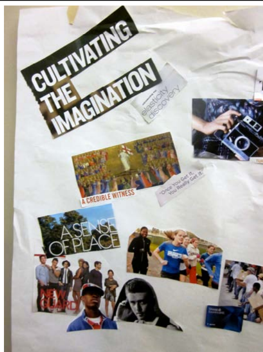
The Vestry spent a day visioning and charting St. John's future. See the display in the Fireside room.