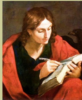
St. John the Evangelist- painting by Reni Guido (1575-1642)

All Saints' Day is the day when we give thanks for all the good people God has placed in our lives, especially those who have died. All Saints is celebrated the first Sunday in November, during the season of Pentecost.