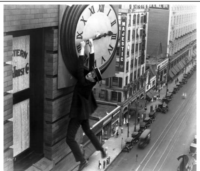
Silent film star Harold Lloyd tries to hang on to time (see page 6)