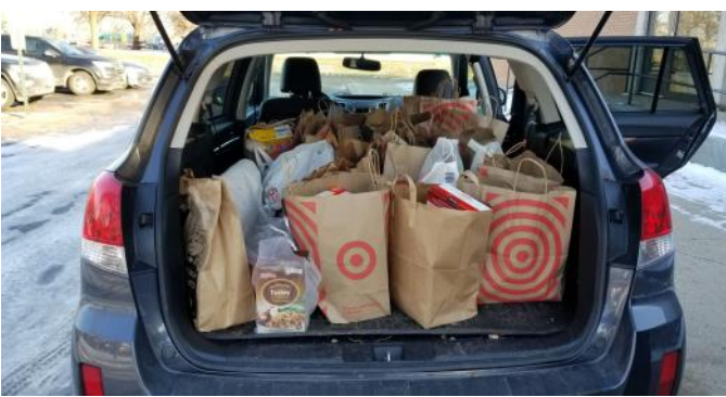
St. John's recent donations.

"...for I was hungry and you gave me food, I was thirsty and you gave me something to drink"