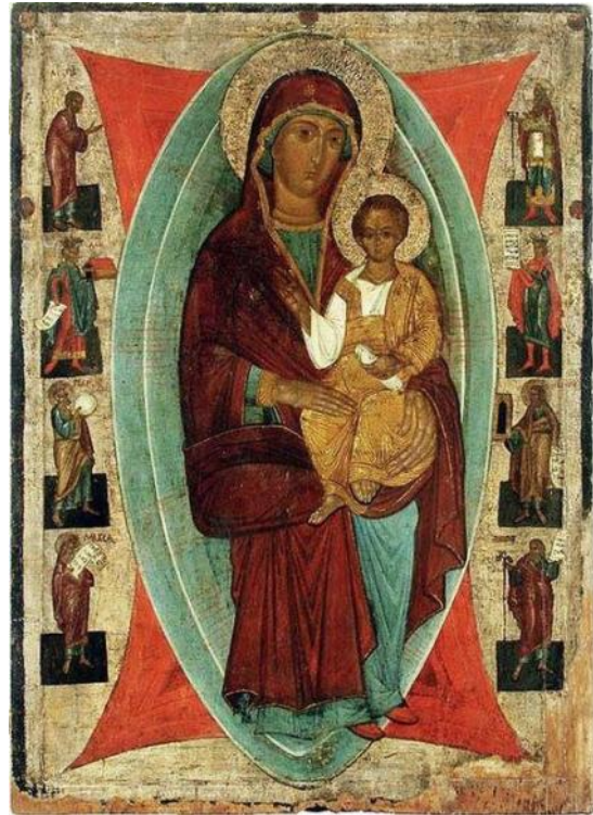
Orthodox Icon of the Virgin and the Christ in Mandorla, Sanok (Poland), 16th century

In the second half of life. I find myself feeling incomplete. The construct of the shadow gives me a framework with which to seek completeness. Transforming conflict into paradox points a way forward. The religious experience is a