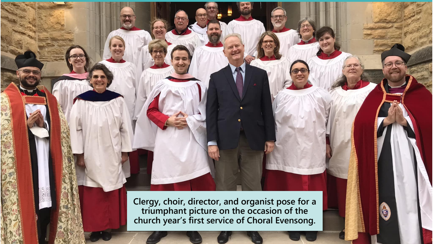
Clergy, choir, director, and organist pose for a triumphant picture on the occasion of the church year's first service of Choral Evensong.