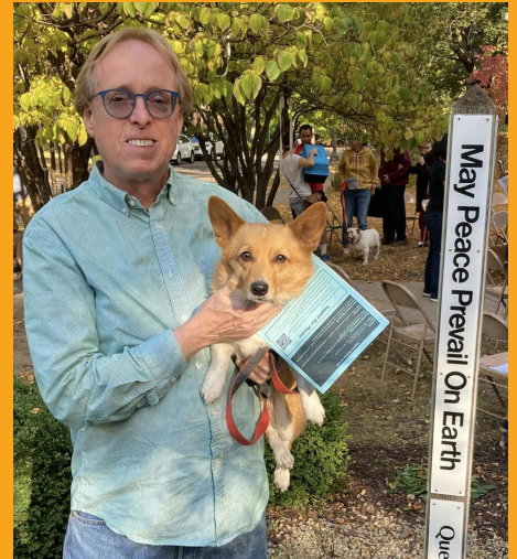
Parishioners and neighbors gathered for the annual Blessing of the Animals on October 9.